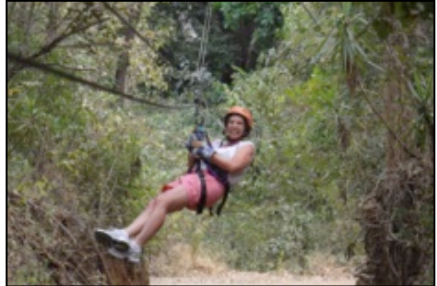
Zip-lining in Costa Rica