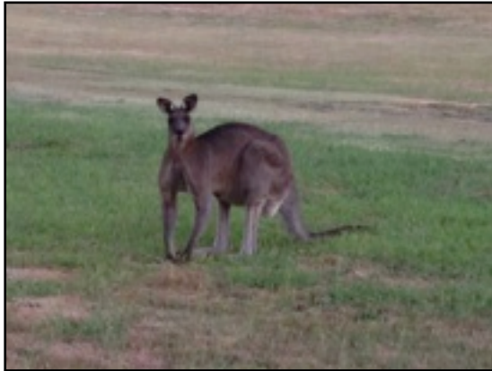
You can get very close to the kangaroos. This one was enjoying the golf course in Mount Beauty