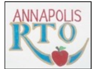
LOGO - Just a rough draft. Colours are similar to the provincial logo.